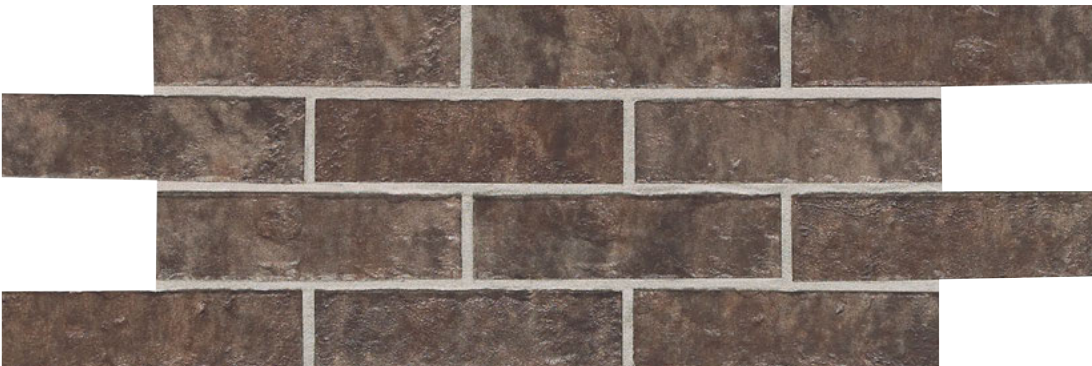
COBBLE BROWN US04