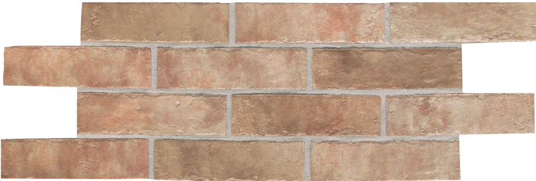
HEIRLOOM ROSE US02