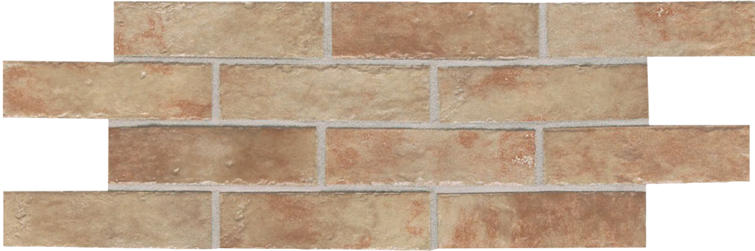
TERRACE BEIGE US01