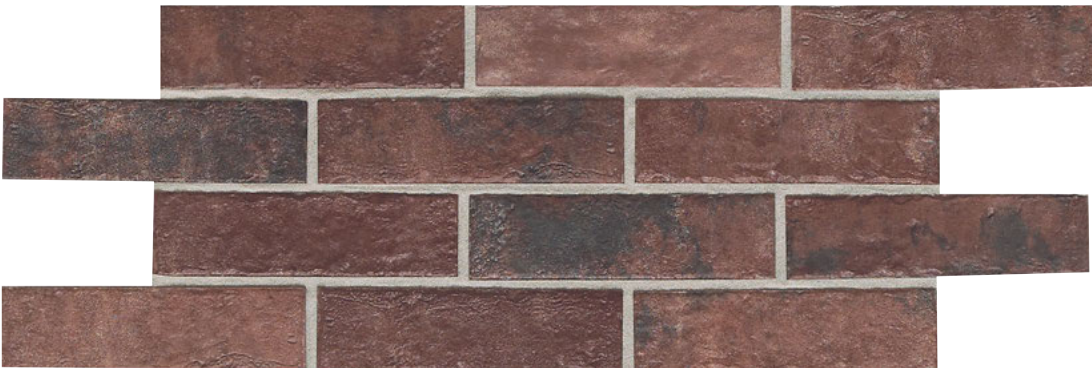
COURTYARD RED US03