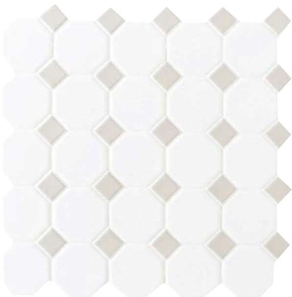
MATTE WHITE 6501W TH 44 GRAY GLOSS DOT