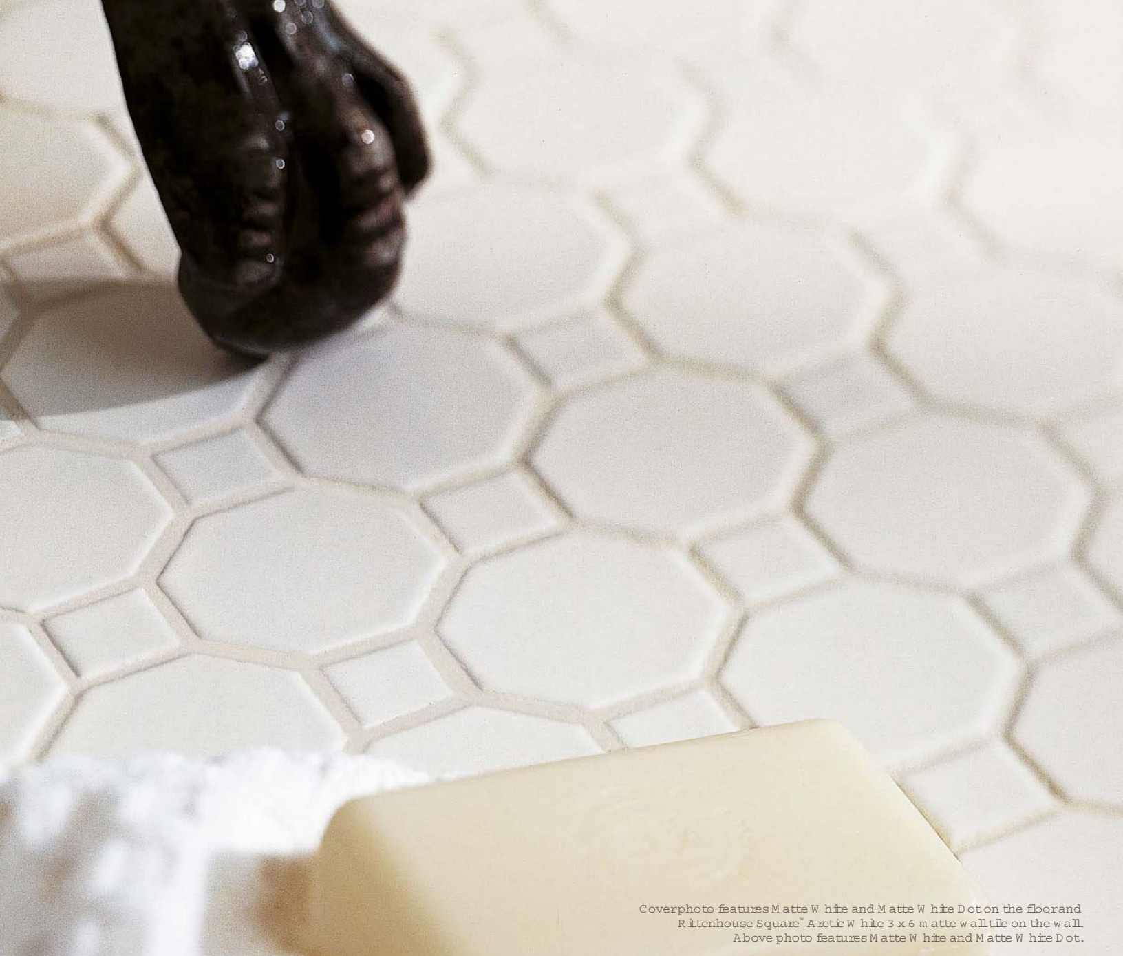
Coverphoto features Matte White and Matte White Dot on the floor and Rittenhouse Square™ Arctic White 3 x 6 matte wall tile on the wall. Above photo features Matte White and Matte White Dot.