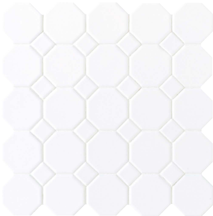
MATTE WHITE 6501W TH 01 WHITE DOT